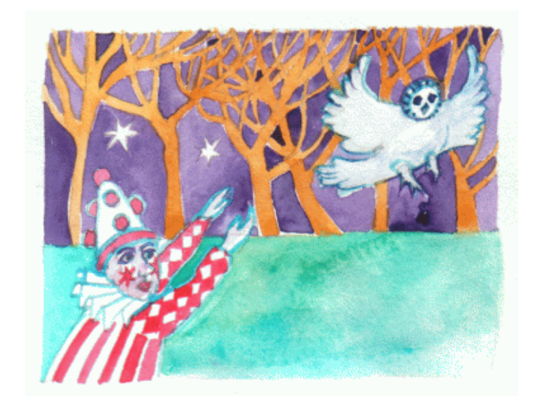
Dimidium facti qui coepit habet: sapere aude. To have begun is half the job: be bold and be sensible. Horace, Epistles 65- 68BC.