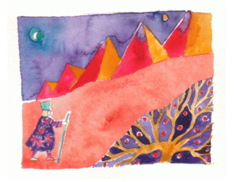
The road up and the road down are one and the same Heraclitus, Die Fragmente der Vorsokratiker c540-480BC.