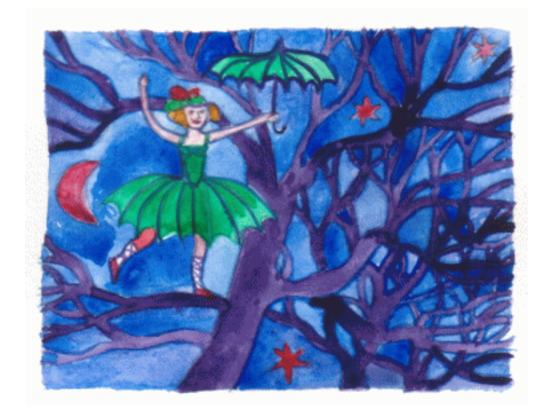
The spirit of self-help is the root of all genuine growth in the individual. Samuel Smiles, Self-Help 1859.