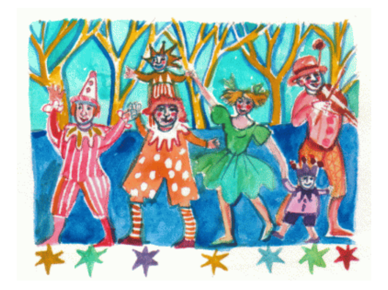
There is no such whetstone, to sharpen a good wit and encourage a will to learning, as is praise. Roger Ascham, The Schoolmaster 1570.